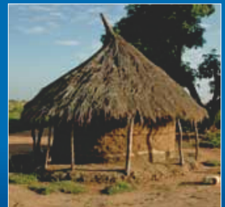
Huts made of mud and reed

From the bakery we proceed to the sleeping quarters of the children who are in the care of the sisters. The poverty there hits us in the face. Apart from a bed with a grimy blanket their only possession consists of a small iron box in which they can keep their personal effects. Despite these miserable circumstances (as perceived by us) the children are cheerful and full of care for each other and they laugh and play a