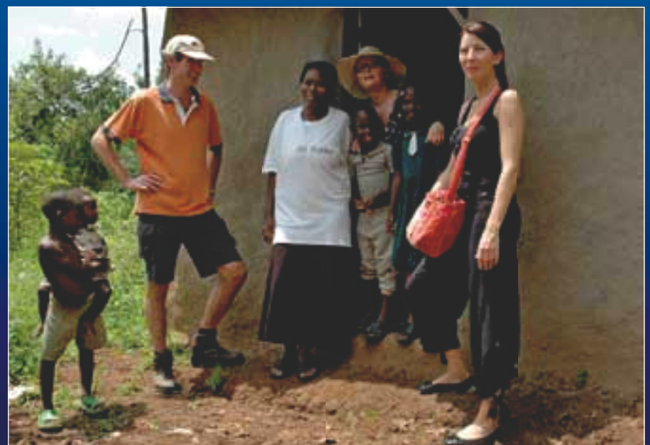
Meeting the local population