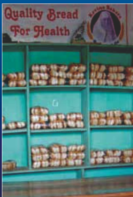
The BFL shop looking spruce

During our trip to Soroti we stop in Budaka for a longer period of time. In Budaka there's also a BFL bakery. We are welcomed by singing and dancing children. We are given a lengthy tour of the bakery and the compound. Here, too, a lot of activity is going on: baking