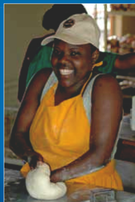
Contributing enthusiastically in spite of disability

In the morning we leave by bus for the nearest town to buy some paint. We will need this to paint the newest BFL bakery in Soroti. Construction activities have almost been completed and in January 2010 they will start using it. What to us is a just short trip to the DIY