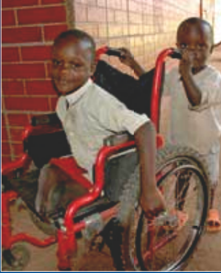
Taking care of each other