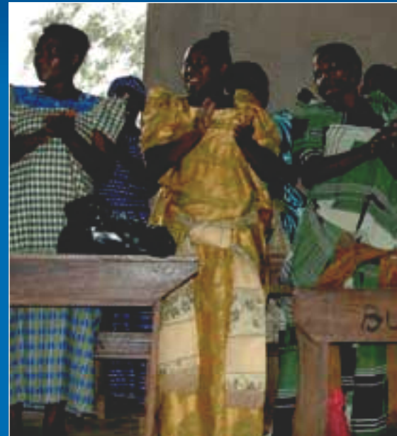
The population welcomes us in the traditional way

We arrive at an old school building where we receive a very warm welcome. Women and children decked out